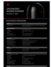
Leica BLK360 Data Sheet

Illustrations, descriptions and technical specifications are not binding and may change. All rights reserved. Printed in Switzerland – Copyright Leica Geosystems AG, Heerbrugg, Switzerland 2019. 872720enus - 04.19