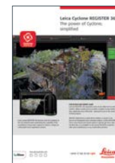
Leica Cyclone REGISTER 360 Data Sheet