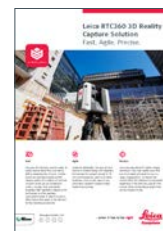
Leica RTC360 Data Sheet